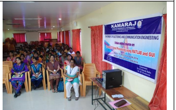
Value added Course on “1D and 2D Signal Processing using MATLAB and GUI” Batch 1: 01.08.2016 to 06.08.2016 Batch 2: 08.08.2016 to 12.08.2016 and 19.08.2016