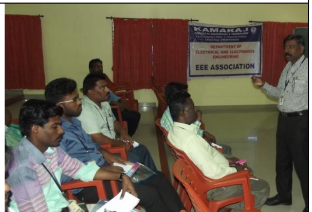
Workshop on 'Servicing & Maintenance of Electrical & Electronics Lab equipments' for Lab technicians on 9 th December, 2016