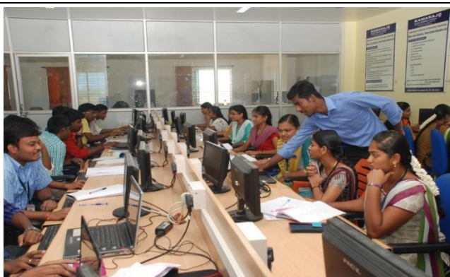
Department of EEE in association with Practical Technologies, Madurai has organized a course on AUTOCAD 2015(2D & 3D).