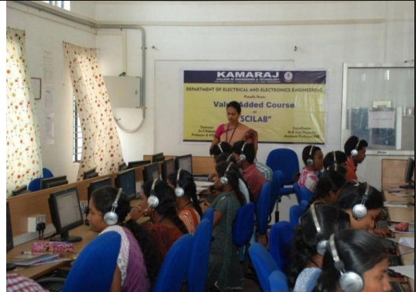
Spoken tutorial on SCILAB by IIT Bombay is conducted for 30 Numbers of II EEE Students.