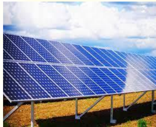
Figure: Solar Panel

electrons, creating a flow of electric current. There are different types of solar cells, including monocrystalline, polycrystalline, and thin-film cells. Each type has its own characteristics in terms of efficiency, cost, and appearance. A typical solar PV system consists of solar panels (made up of multiple solar cells), an inverter (to convert DC to AC), mounting structures, wiring, and sometimes battery storage. Solar cell efficiency refers to the amount of sunlight converted into electricity. Advances in technology have led to improved efficiencies, allowing more power to be generated from a given area of solar panels.